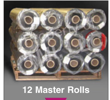
12 Master Rolls

TMI can change Put Up on any material even if we don't sell it. Call us to see if we have the solution for you.