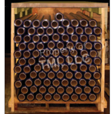
... or Mini Rolls